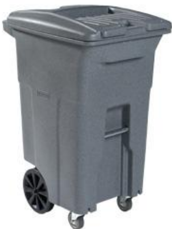
64 or 96 gallon Toter